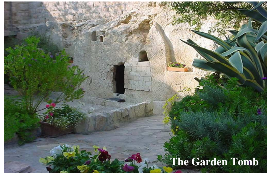
The Garden Tomb