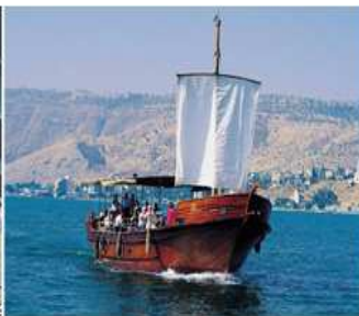
Sea of Galilee Boat Ride