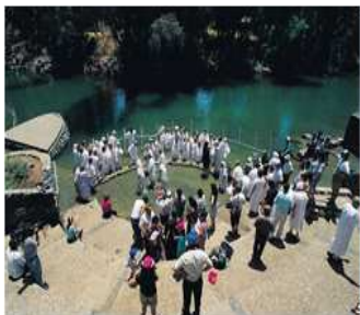
Baptismal Service in Jordan